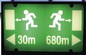
Signposting of emergency exit